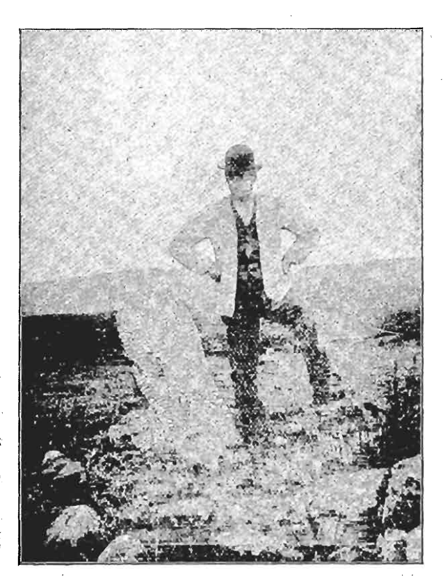
OGHAM MONUMENT, SEEMOCHUDA, NEAR LISMORE.