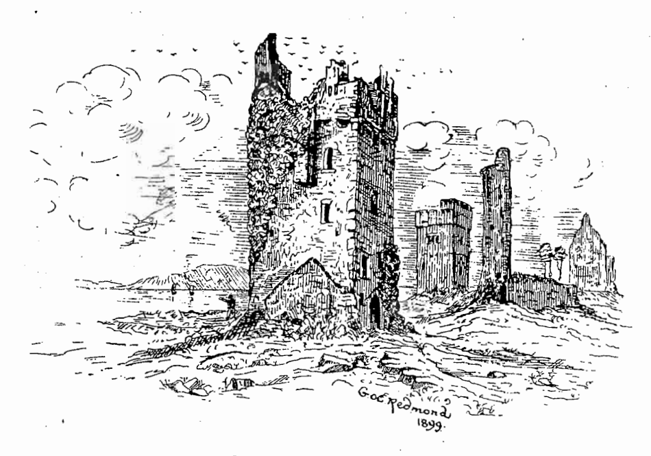
Ruins at Clonmines, Barony of Shelburne.